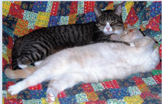
May all animals everywhere find loving homes

Be sure that your attorney or bank has a copy of your will. Because wills are legal documents, bequests should contain the phrase: "I give, bequeath and devise Concern for Helping Animals in Israel (CHAI), POB 3341, Alexandria, VA 22302 the sum of _____ and/or unencumbered properties described as _____ to be applicable for the general purpose of the organization." To add to an existing will, simply write a codicil (an amendment), stating the recipient's full legal name and address. Both wills and codicils must be witnessed and dated. When you're ready for a new car, donate your old one for us to sell on eBay. On behalf of the animals, we thank you!